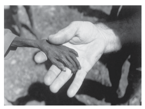
"A Starving Boy and a Missionary."

a connection that transcends the boundaries of wealth. race, and religion. Here, on the plains of hell, the Child with the Withered Hand and a complete stranger forge an eternal relationship of unity and friendship. Together they have discovered