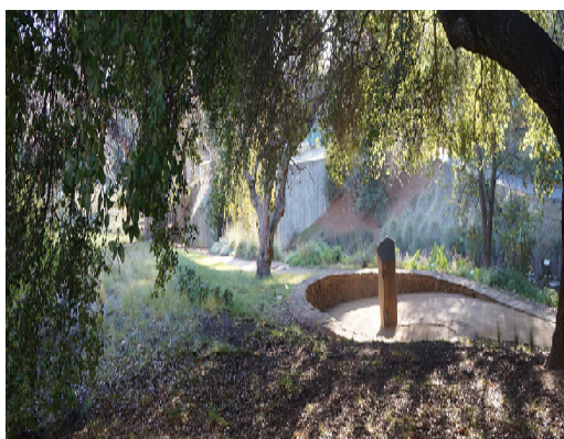
Figure 1. UC Davis, UC Davis Patwin Memorial, UC Davis Arboretum, Davis, California, 2011.

The Patwin Memorial, also known as the Native American Contemplative Garden, is located between the Mondavi Center and the School of Law’s King Hall. It was conceptualized by UC Davis students and faculty of Native descent, members of the Patwin