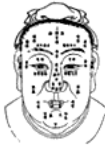
Illustration 4 The Twelve Palaces and Five Officials