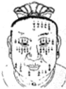
Illustration 9 Female moles