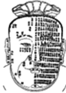
Illustration 5 The Thirteen Parts of the Face