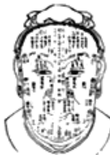
Illustration 6 Yearly Fortune