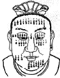
Illustration 7 Auspicious and Inauspicious Facial Moles