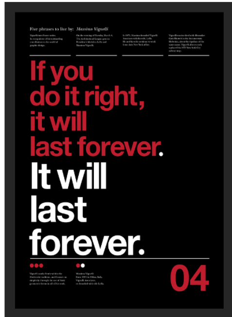
Figure 1. Anthony Neil Dart, If you do it right, it will last forever , from the Helvetica poster series Vignelli Forever . Published June 7, 2011.

balance between black and white; “it’s not a letter that’s bent to shape, it’s a letter that lives in a matrix of powerful surrounding space.” 5 This awareness of weight distribution between line and space—the tension of white space around the black letters—is put into poetry by Massimo Vignelli, an Italian designer who has studied the Swiss style. Vignelli proclaims that “like in music, it’s not the notes, it’s the space in between the notes that make the music.” 6 Vignelli’s influential design rhetoric has made him widely known in the field, and the poster series Vignelli Forever by Anthony Neil Dart has been designed in his honor (Fig. 1). To those