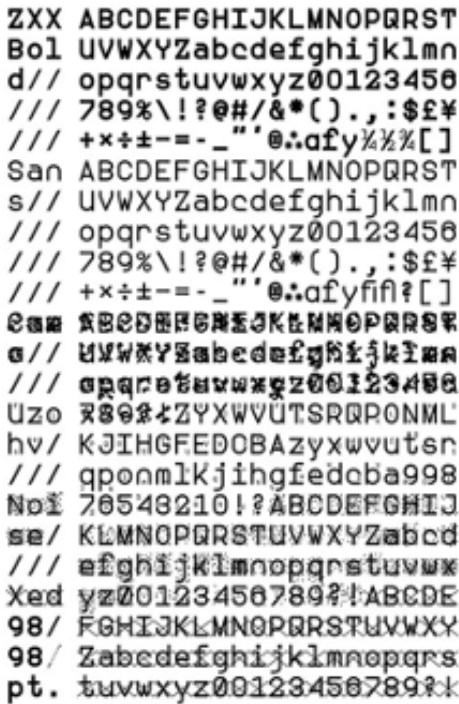
Figure 4. Sang Mun, ZXX type specimen poster series, designed 2012, printed 2016.

Noise has pixels covering the letters; the amount of noise corresponds to recognizability—the more recognizable, the more noise surrounds the letter to further obscure it. Xed simply x-es out the letters and is the most successful at disruption, due to the fact that the X's placed on the letters activates all four corners of empty space surrounding the letters. 15 They all function similarly to CAPTCHA tests that determine whether someone online is human or a bot.