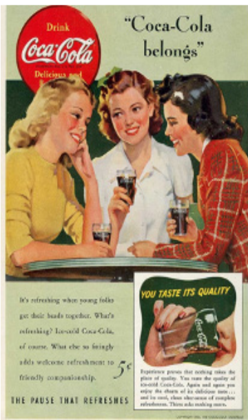
Figure 2. Coca-Cola, Coke Belongs. Coca-Cola Ads , published 1941.

What Bierut described as the ice-cold splash personifies Helvetica's modernist spirit and quelling of the market's need for a sans, minimalist type. The transition from the graphic design norms prior to the 1950s to the late 1960s following Helvetica is illustrated by the two Coca-Cola advertisements from each respective time period (Figures 2-3). One, from 1941, emblemizes the characteristics described by Bierut in his anecdote, while in the other, an ad campaign post-Helvetica, the