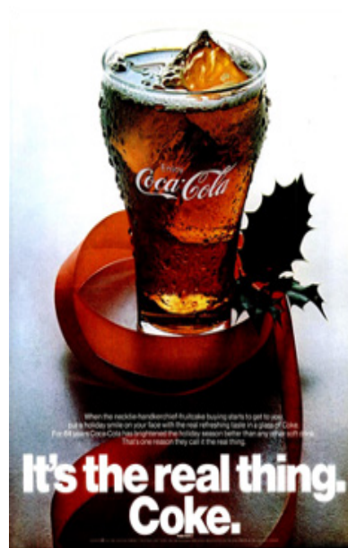
Figure 3. Coca-Cola, It's the Real Thing. Coca-Cola Ads , from a series published 1969–74.