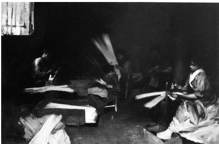
Fig. 3. title. credit line.

Baedeker's description. Three women occupy the bare space of an interior scene. Two women sit, facing the audience, preoccupied with their bead-stringing. Another woman stands, with her back to the viewer, watching the two working. They "appear self-absorbed, and completely undemonstrative." The women look down or off into the distance. 18 When looking at this painting, the viewer receives no sense of Baedeker's locals. These women are not about to besiege the viewer, beg for charity, or bother the viewer in any way. Furthermore, they are free from the scrutiny of the tourists. The only tourist present is Sargent, and he allows the locals to exist in a sheltered community behind the architecture and entertainment that the tourists scramble to see.