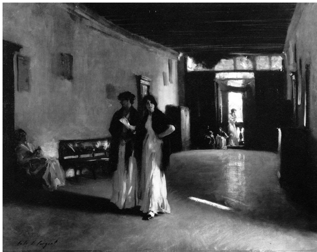
Fig. 1. John Singer Sargent, American, 1856–1925, Venetian Interior , 1880–82, Oil on canvas, 68.3 x 87 cm, Carnegie Museum of Art, Pittsburgh, purchase. Photograph copyright 2007 Carnegie Museum of Art, Pittsburgh.

It is these back regions that Sargent was attempting to represent in his 1880–1882 compilation. He chose not to capture the canals, hotels, shops, theaters, churches, or entertainment areas of the city, places where the atmosphere caters to the tourist, where most tourists were guided, and which were the places most artists depicted. Instead, he chose to render the darkened interiors and claustrophobic back alleys, places not created to appeal to the tourist, but which provide a glimpse into the dark places behind the action and attraction of the mystical city. In these shadowy, box-like areas, Sargent portrays the world of the “genuine” Venetian, the working class that creates the products that are sold as souvenirs. These Venetians do not put on a show to suit the tourist’s idea of what Venice should be. The places they occupy are not luxurious or even attractive. The women are shown working ( Venetian Interior ) (fig. 1); the men and women in the alleys interact in a casual, suggestive way